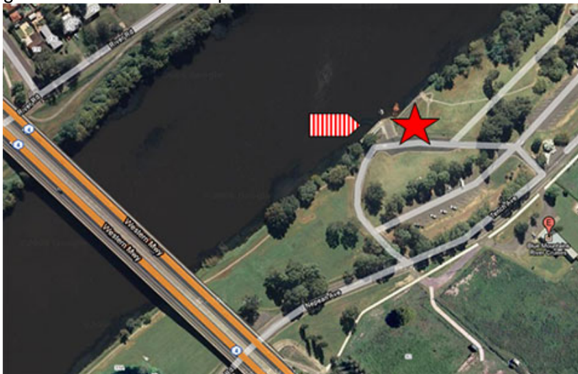
Tench Reserve boat ramp, Tench Avenue at Jamisontown